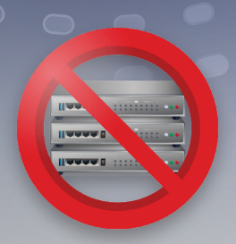
No New Software, Hardware, or Agents to Install